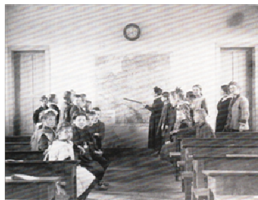
classe d'immigrés polonais 1926

The government struggle against illegal immigration has prompted France to help developing countries create more employment opportunities to encourage potential immigrants to stay in their countries.